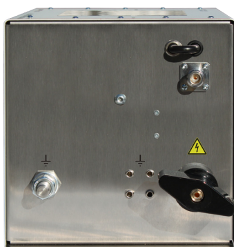
HV-AN 200, view to the EUT port