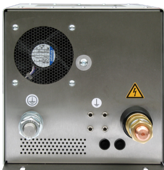
View to the AE port