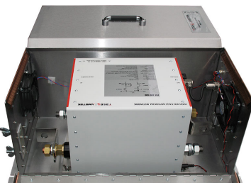
HV-AN 1uH-800-VW80300 inserted in option SME HV-AN-500