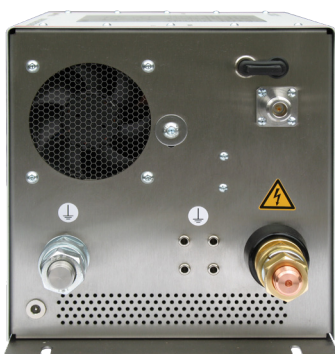
View to the EUT port