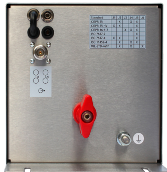
HV-AN 150, view to the EUT port

© March 2024 Teseq® Specifications subject to change without notice. Teseq® is an ISO-registered company. Its products are designed and manufactured under the strict quality and environmental requirements of the ISO 9001. This document has been carefully checked. However, Teseq® does not assume any liability for errors or inaccuracies.