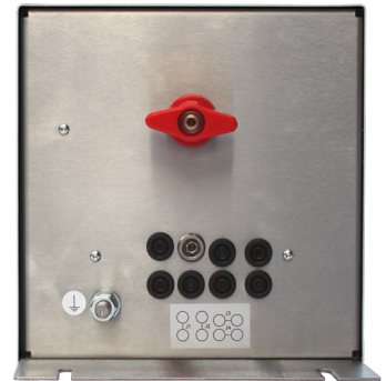
HV-AN 150, view to the AE port