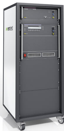
NetWave 7 integrated in a rack with DPA 500N